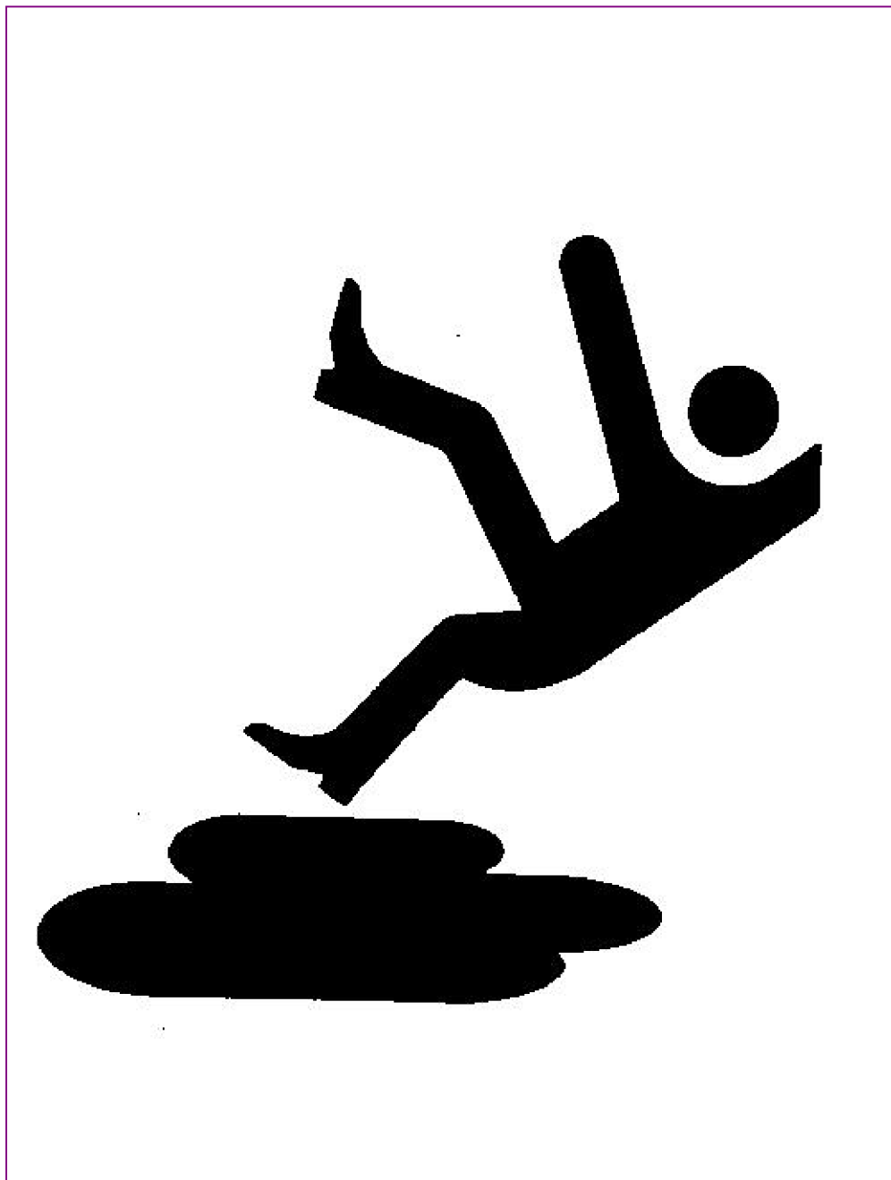
TS218-UN: Keep Area Clean

Understand service procedure before doing work. Keep area clean and dry.