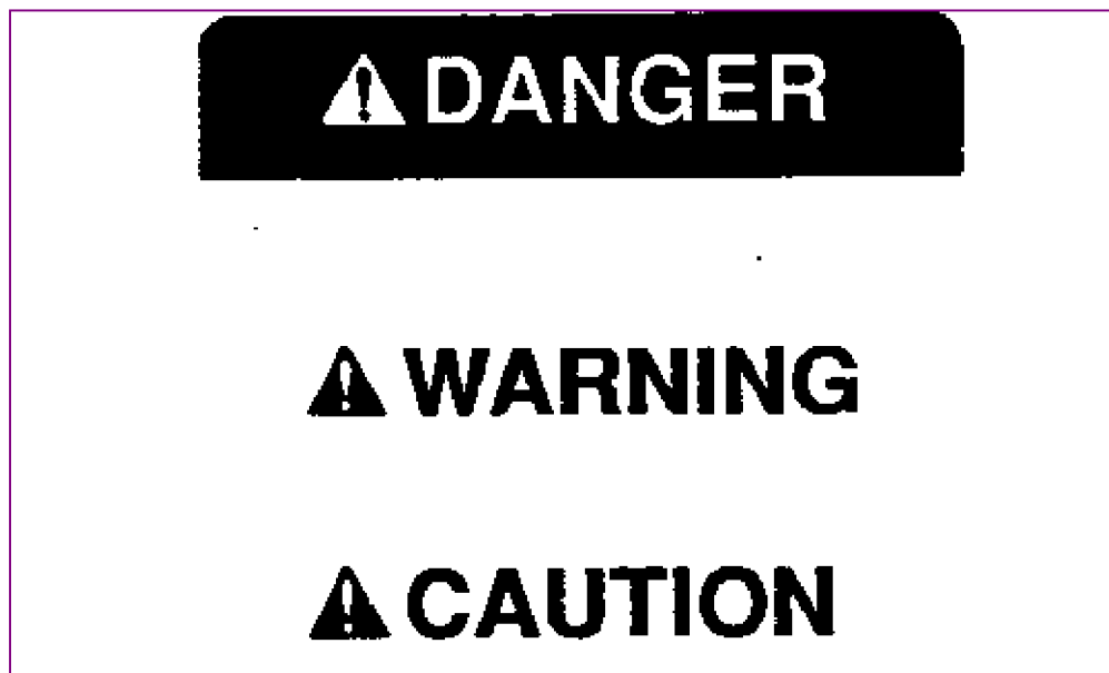
TS187-19: Signal Words

A signal word—DANGER, WARNING, or CAUTION—is used with the safety-alert symbol. DANGER identifies the most serious hazards.