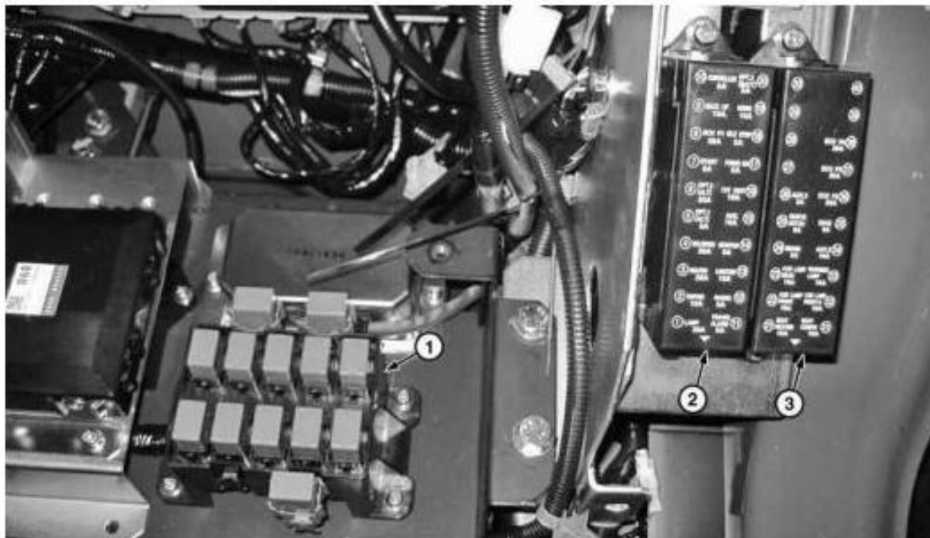
Relay and Fuse Block Component Location