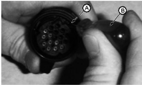
T104764B-UN: Metri-Pack® Connector