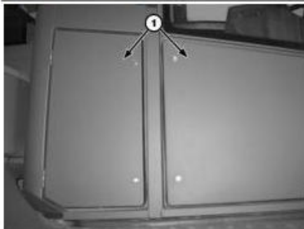
Cab Harness Access Panels