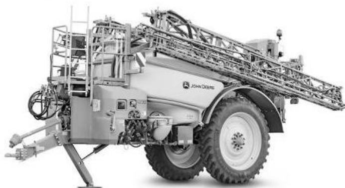
M962i Left Side View