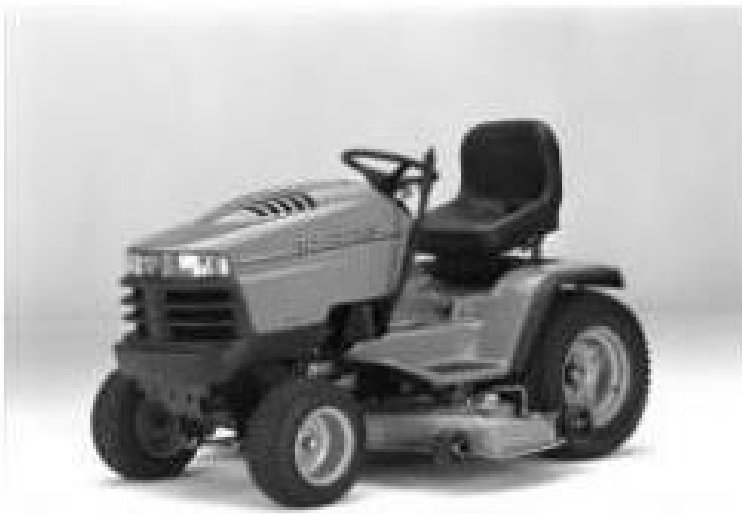
Sabre 2048HV Garden Tractor