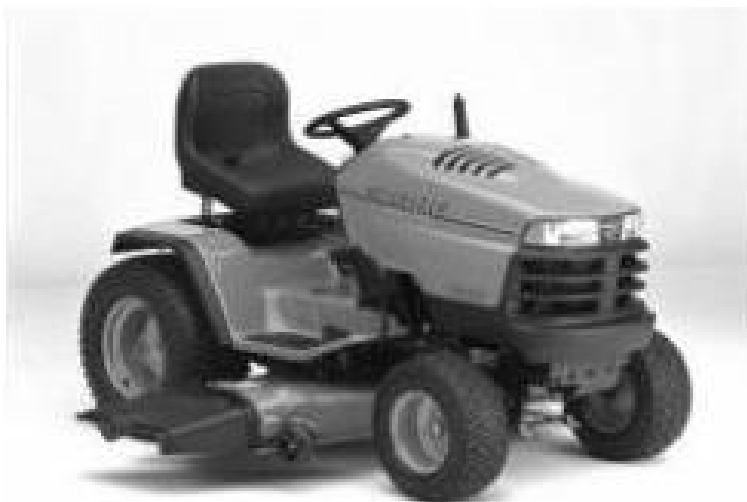
Sabre 2554HV Garden Tractor