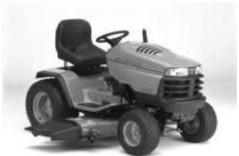
Sabre 2254HV Garden Tractor