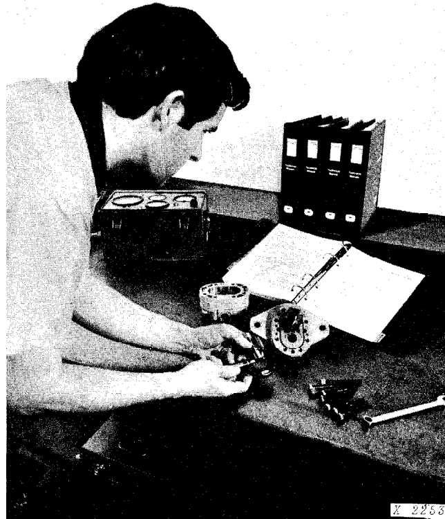
Use Technical Manuals for Actual Service

This technical manual is part of a twin concept of service: