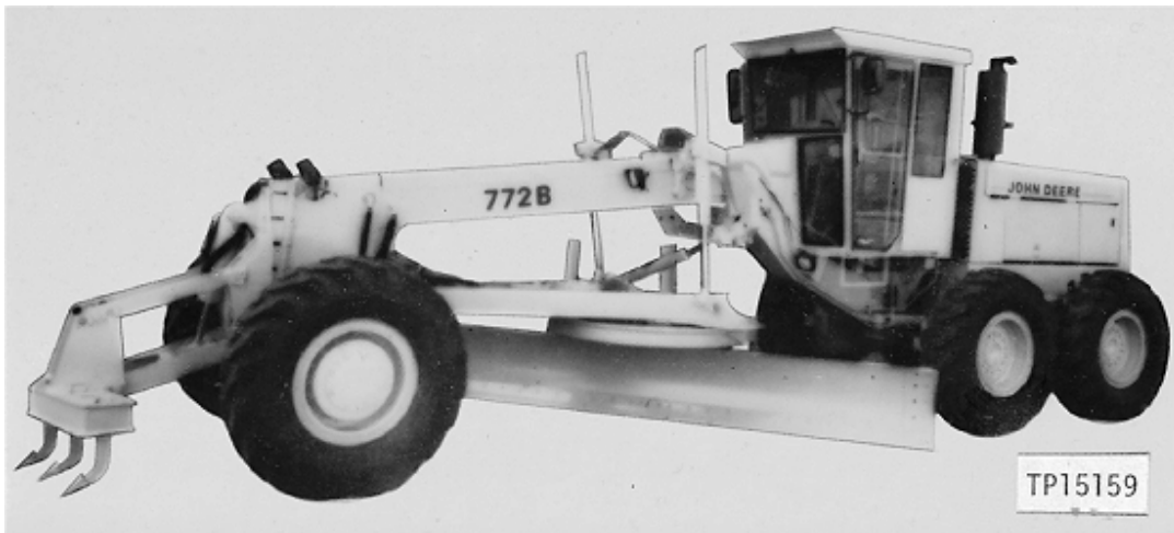
LEFT SIDE VIEW OF JOHN DEERE 772B MOTOR GRADER (MANUFACTURED 1986- )