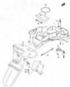
FIG.46 REAR FENDER (8-6)