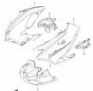
FIG.49B SIDE COWLING (MODEL K4) (8-13)