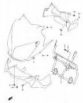
FIG.48 COWL BODY INSTALLATION PARTS (MODEL K2/K3) (8-9)