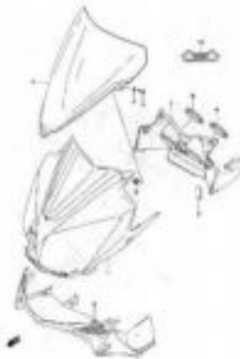
FIG.47 COWLING BODY (MODEL K2/K3) (8-7)