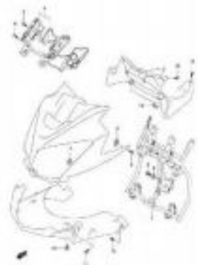
FIG.48A COWL BODY INSTALLATION PARTS (MODEL K4) (8-10)