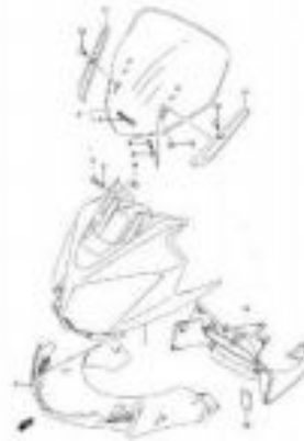
FIG.47A COWLING BODY (MODEL K4) (8-8)