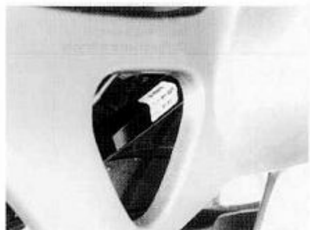
(4) The color label is attached as shown. When ordering color-coded parts, always specify the designated color code.