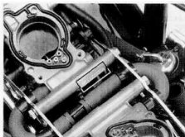
(3) The carburetor identification numbers are stamped on the intake side of the carburetor body as shown.