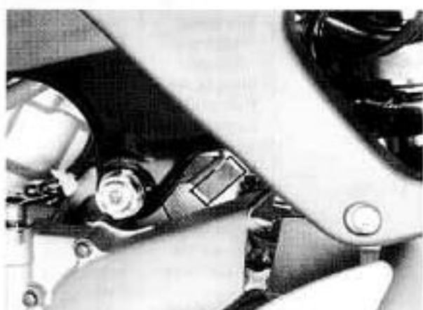
(2) The engine serial number is stamped on the rear of the upper crankcase.