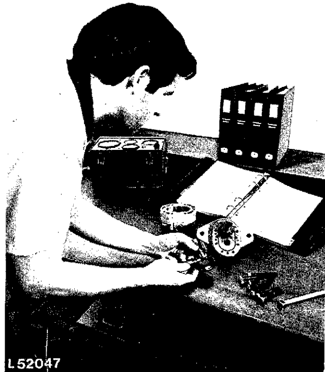
Use Technical Manuals for Actual Service

When any serviceman should refer to a FOS Manual for more information, a FOS symbol like the one at the left is used in the TM to identify the reference.