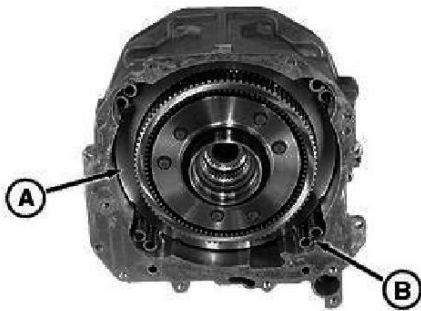
RXA0066509-UN: Removing Pressure Plate and Springs