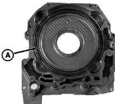
RXA0066510-UN: Removing Reverse Brake Piston