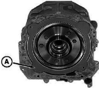
RXA0066508-UN: Removing Reverse Brake Disks