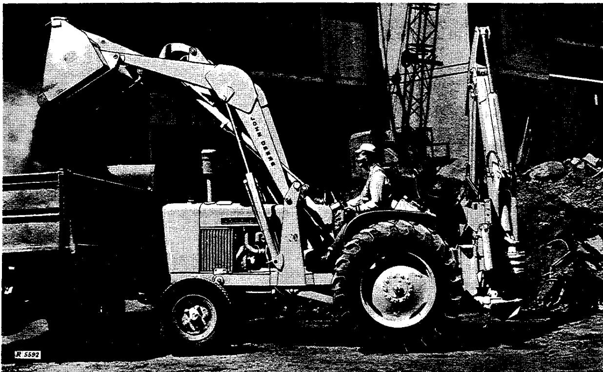
John Deere 3010 Wheel Tractor with Loader and Backhoe

Daily use of the Service Manual as a guide for any and all service problems will reduce error and costly delay to a minimum and assure you the best in finished service work. In many instances your customer's confidence in your work will be improved when he sees you using the Service Manual. He knows you are following approved maintenance procedures and making proper adjustments. There is no guesswork when you use the manual.