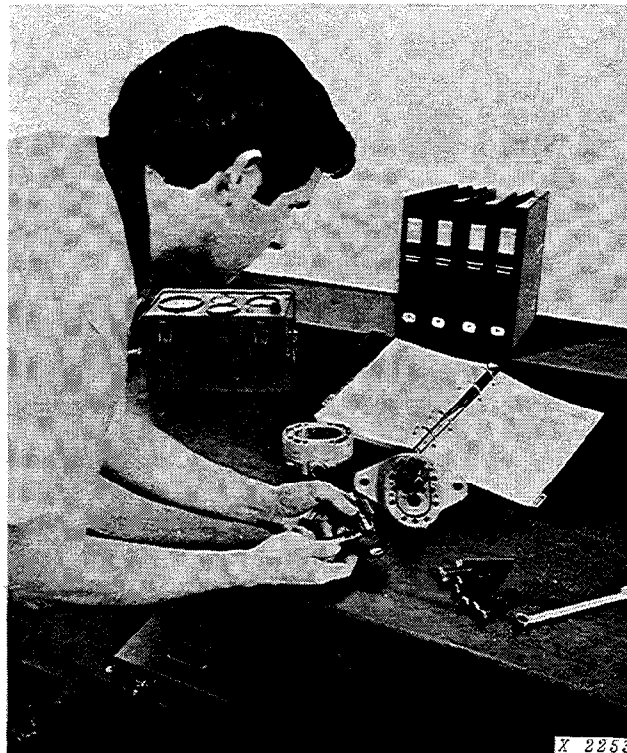
Use Technical Manuals for Actual Service

This technical manual is part of a twin concept of service: