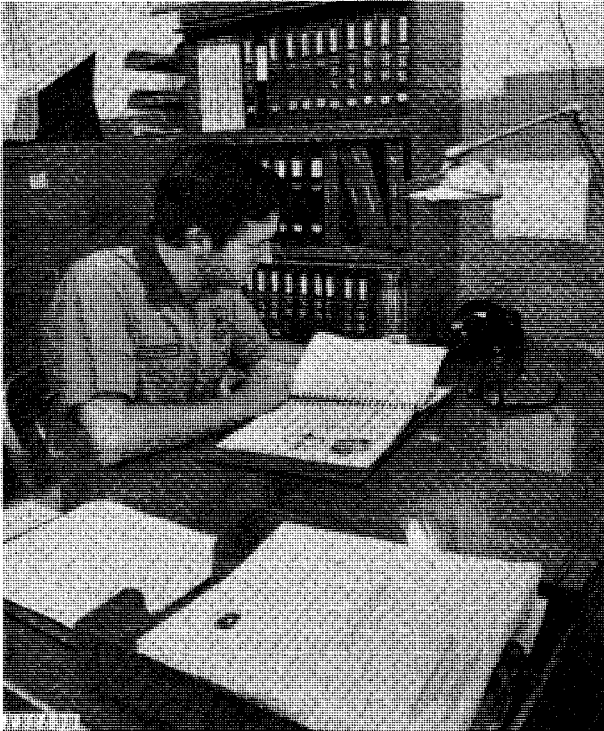
Use FOS Manuals for Reference