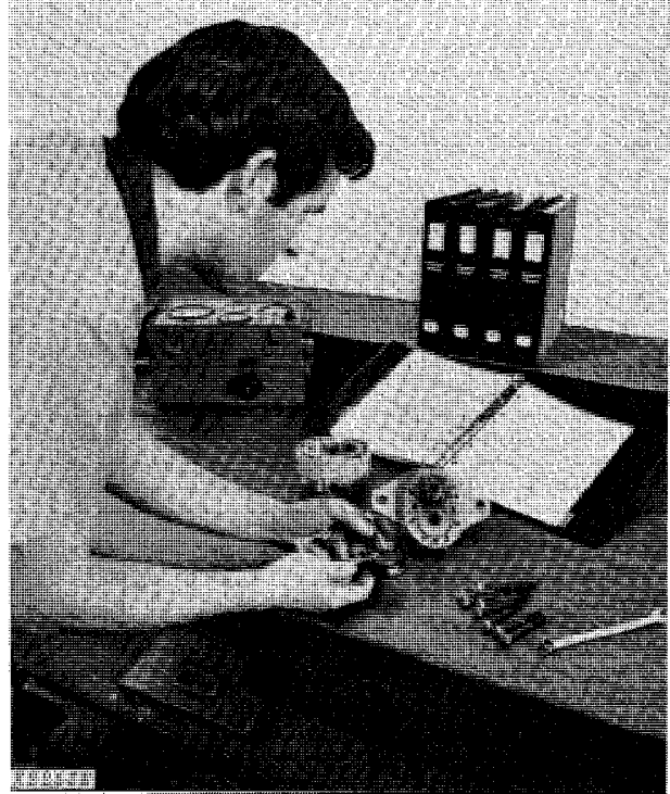
Use Technical Manuals for Actual Service

This technical manual is part of a twin concept of service: