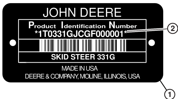
TX1216544-UN: Example of PIN Plate