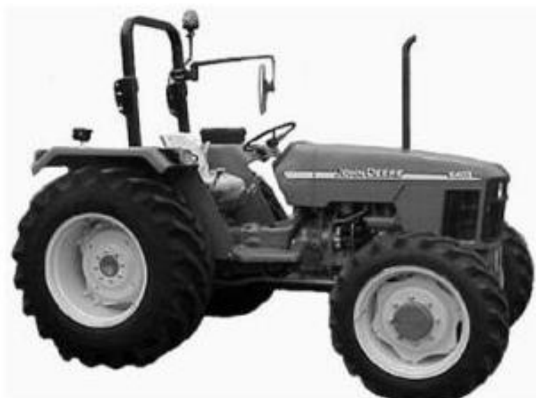
John Deere 5403 Tractor