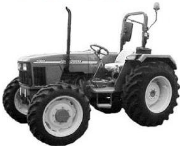
John Deere 5303 Tractor